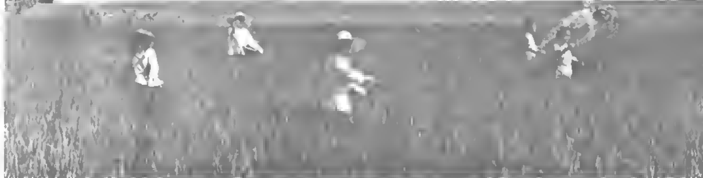
Commune members using nitrogenous fertilizer produced in a plant right next to their fields.